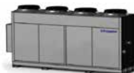
FWC 2000 – 2000(S)11 Four Circuit 180 – 300kW @ +7°C 90 – 270kW @ -6°C