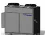
FWC 650 – 870(S)9 Twin Circuit 70 – 100kW @ +7°C 50 – 110kW @ -6°C