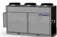
FWC 1300 – 1500(S)10 Three Circuit 100 – 180kW @ +7°C 80 – 190kW @ -6°C