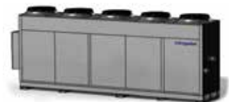
FWC3000 – FWC3000(S)17 TC Five Circuit 200 – 600+kW @ +7°C 200 – 500kW @ -6°C